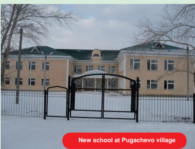
New school at Pugachevo village