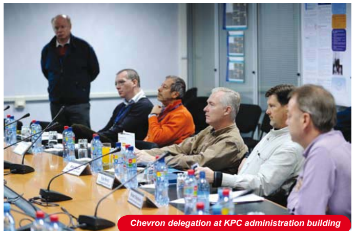
Chevron delegation at KPC administration building

During their stay at Karachaganak they met with KPO senior representatives, who provided the visiting group with a brief field overview, and update on 2010 performance. After the meeting at the Administration building of KPC, Chevron executives also toured the Karachaganak facilities and met senior CVX staff working in KPO.