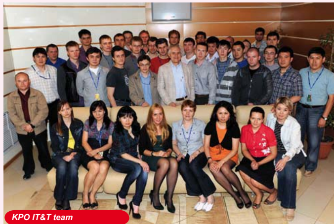
KPO IT&T team

all KPO departments through a series of services that include integrated computer systems, telephone and radio systems, coordinating and providing training, negotiating and managing information technology related contracts, and technology assistance and support. The department creates the technological environment that enables KPO employees to quickly access vital information using the most efficient and cost effective system hardware and software. The department provides leadership as an active partner in local and international telecommunications and data-sharing network.