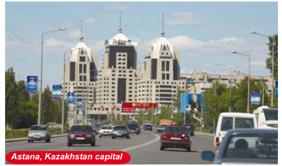
Astana, Kazakhstan capital