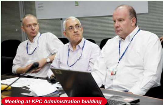
Meeting at KPC Administration building