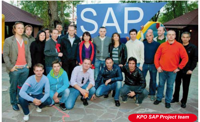
KPO SAP Project team

provide training to create the expertise and knowledge and experience required in the organisation. There will also be regular communication to keep you informed of the progress of the project.