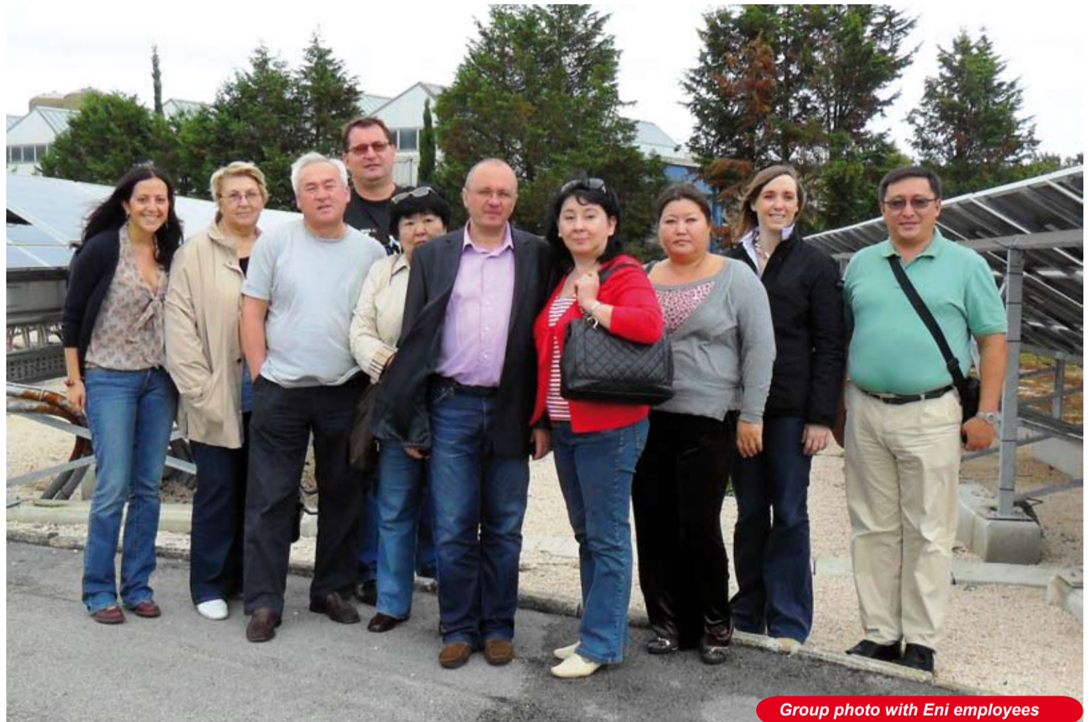
Group photo with Eni employees

Eni refers to Karachaganak as a field with good infrastructure and one of the largest sizes in the world, at more than 450 square km. This area is literally saturated with hydrocarbons at a depth of 3,500 metres.