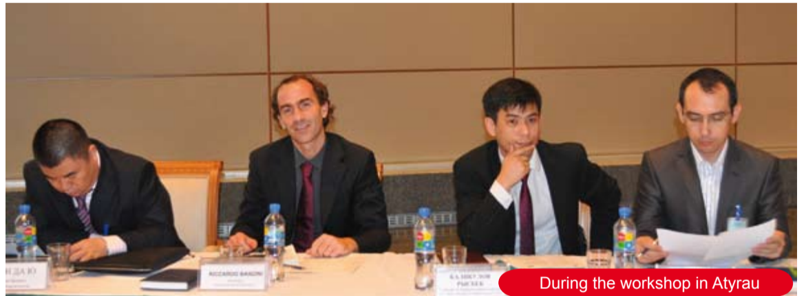
During the workshop in Atyrau