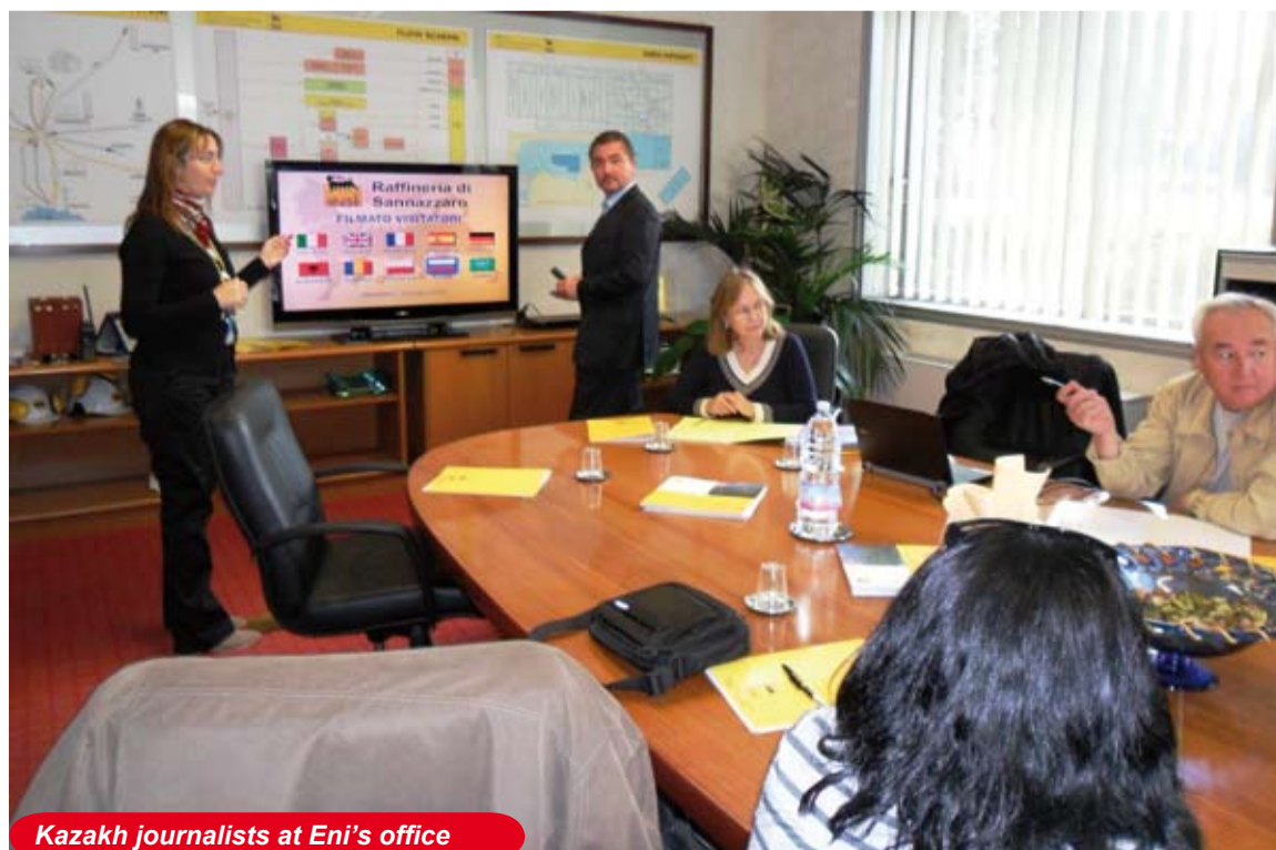
Kazakh journalists at Eni's office

The plant works on imported oil, which goes to the nearest port in Genoa, via tankers. As per 2009 indicators, 37% of the oil comes from Russia, 26% from Azerbaijan, 8% from Kazakhstan, 10% from Middle East, 13% from Africa, 4% from Italy, and 2% comes from Norway.